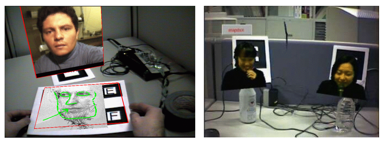
Figure 2: Live virtual video avatars for remote collaborative AR interfaces

Our early AR Conferencing interfaces were developed to explore how AR could be used to support remote collaboration, and to provide gaze and non-verbal communication cues. In our first interface a user wore a lightweight headmounted display with a camera attached and was able to see a single remote user appear attached to a real card as a life-sized, live virtual video window [Billinghurst 2000]. The overall effect was that the conference collaborator appeared projected into the local user's real workspace (figure 2).