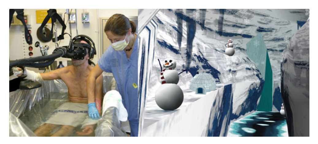
Fig. 1 Left, a burn patient getting wound cleaning/debridement in a hydro(scrub) tank "goes into" the immersive virtual world (shown on the right) to distract him from his excessive pain. The custom water-friendly system uses fiberoptic image guides to safely transmit computer-generated images from the immersive virtual reality to the patient via photons ( light).