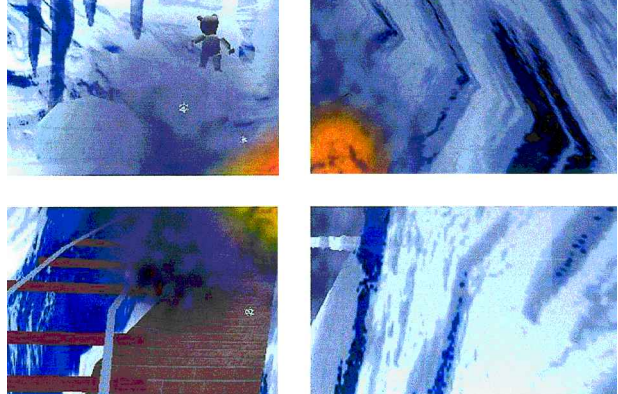
FIG. 3. Example of Snow World low-presence condition.