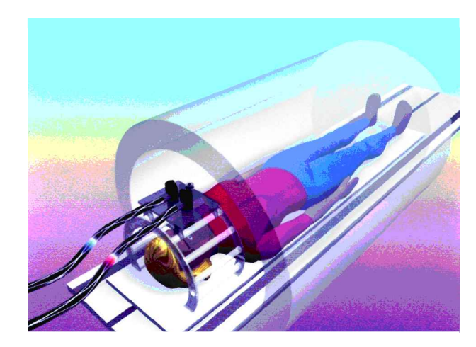
FIG. 1. Subject in an MR magnet looking into VR goggles.